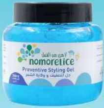
PREVENTIVE STYLING GEL